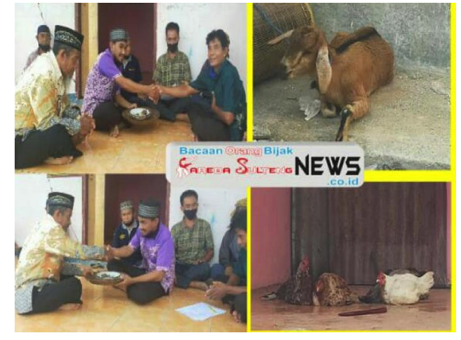
Figure 3. Givu customary law

According to the opinion of the head of the Kacandipa custom in Loru Village, Sigi Biromaru District, that: In ancient times, until now, people have always lived side by side with nature, especially forests. (Rukandar, 2009) will provide a source of life for the community because by protecting the forest it will maintain a clear water discharge and as a source of life for the people who live in the plains, the majority of whom live as farmers.