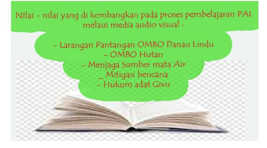
Figure 5. Local Wisdom Values Developed in the Learning Process

activity of the teacher is to greet, ask how students are doing and check student attendance through the class WA group. The teacher conveys the learning objectives through the wa group. The teacher displays learning media using media images related to the material discussed on this topic. In this activity the teacher also uploads audio-visual media that can be accessed by students so they can access audio-visual media with links https://youtu.be/-b4IZ-an8TU YouTube which can be accessed by students on the topic of ecological local wisdom values in the Kaili Ethnic community in Sigi Regency.