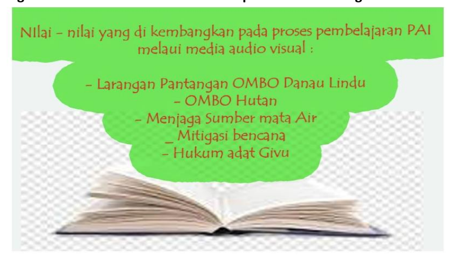
Figure 5. Local Wisdom Values Developed in the Learning Process

activity of the teacher is to greet, ask how students are doing and check student attendance through the class WA group. The teacher conveys the learning objectives through the wa group. The teacher displays learning media using media images related to the material discussed on this topic. In this activity the teacher also uploads audiovisual media that can be accessed by students so they can access audio-visual media with links https://youtu.be/-b4IZ-an8TU YouTube which can be accessed by students on the topic of ecological local wisdom values in the Kaili Ethnic community in Sigi Regency.