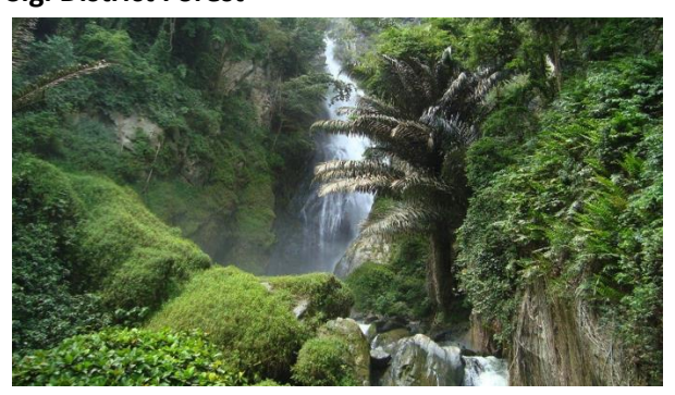
Figure 4. Sigi District Forest

c. Local Ecological Wisdom of Massa Ombo to Prevent Deforestation (Baharudin, 2010)