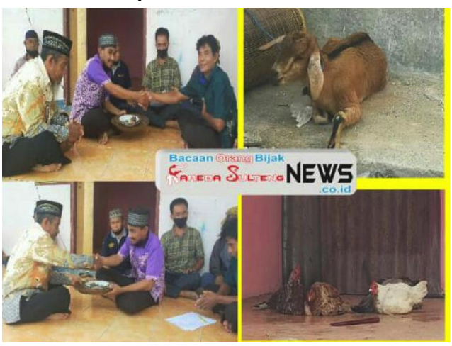
Figure 3. Givu customary law

According to the opinion of the head of the Kacandipa custom in Loru Village, Sigi Biromaru District, that: In ancient times, until now, people have always lived side by side with nature, especially forests. (Rukandar, 2009) will provide a source of life for the community because by protecting the forest it will maintain a clear water discharge and as a source of life for the people who live in the plains, the majority of whom live as farmers.