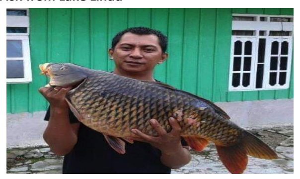
Figure 2. Fish from Lake Lindu

The local wisdom of the people who live in the Lindu lake area as a form of prohibition against fishing known as Ombo is a form of traditional wisdom and community behavior that supports local wisdom to have a high sense of respect for nature, the environment which is an institution that cannot be separated from social life. society related to the values, rules, norms contained in the Ombo local