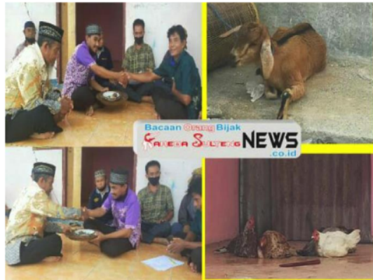
Figure 3. Givu customary law

According to the opinion of the head of the Kacandipa custom in Loru Village, Sigi Biromaru District, that: In ancient times, until now, people have always lived side by side with nature, especially forests. (Rukandar, 2009) will provide a source of life for the community because by protecting the forest it will maintain a clear water discharge and as a source of life for the people who live in the plains, the majority of whom live as farmers.