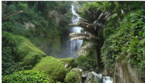
Figure 4. Sigi District Forest

c. Local Ecological Wisdom of Massa Ombo to Prevent Deforestation (Baharudin, 2010)