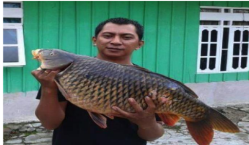
Figure 2. Fish from Lake Lindu

The local wisdom of the people who live in the Lindu lake area as a form of prohibition against fishing known as Ombo is a form of traditional wisdom and community behavior that supports local wisdom to have a high sense of respect for nature, the environment which is an institution that cannot be separated from social life. society related to the values, rules, norms contained in the Ombo local