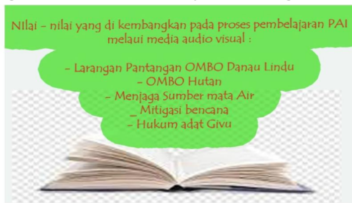
Figure 5. Local Wisdom Values Developed in the Learning Process

activity of the teacher is to greet, ask how students are doing and check student attendance through the class WA group. The teacher conveys the learning objectives through the wa group. The teacher displays learning media using media images related to the material discussed on this topic. In this activity the teacher also uploads audio-visual media that can be accessed by students so they can access audio-visual media with links https://youtu.be/-b4IZ-an8TU YouTube which can be accessed by students on the topic of ecological local wisdom values in the Kaili Ethnic community in Sigi Regency.