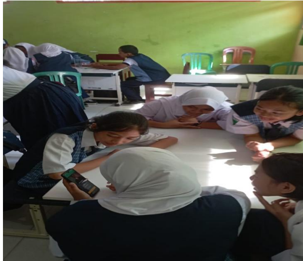
memrise application learning