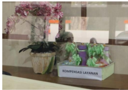
Image 3. Compensation goods Palu Religious Court