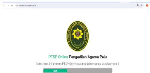
Image 2. Online PTSP Website of Palu Religious Court

Source: (Layanan PTSP Online Pengadilan Agama Palu, 2024)